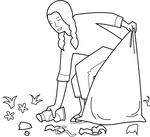
Jesus taught us to pray, but also to DO!